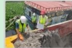
Photo: Our team involving with the environmental quality survey on different projects