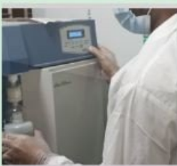
Photo: Ourlaboratory arrangement